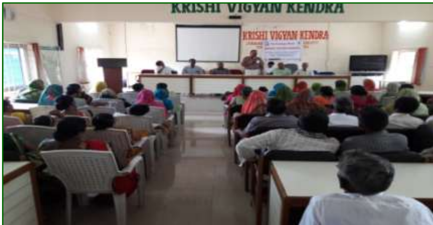
Celebration of Technology Week from 25 to 29 September, 2017