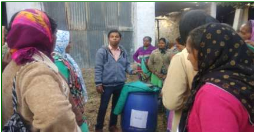
Demonstration of Jivamrut Unit for organic farming to farm women at KVK, Nana kandhasar