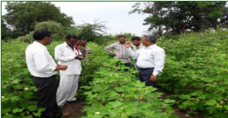
KVK Scientist visited cotton field at Navagam village of Thangadh taluka on 20 th Sept., 2017 Cv: Bt. Cotton, Infestation: Pink Bollworm