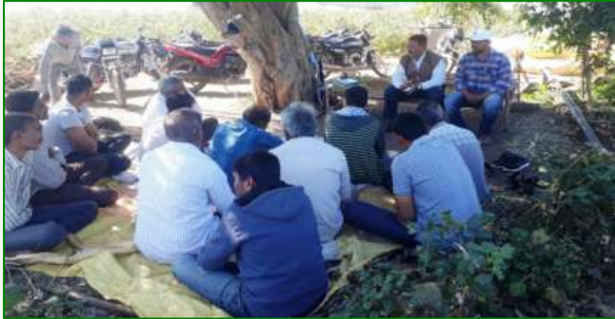
KVK scientist and farmers discussing agricultural issue during farmer Meeting in Rampara village.