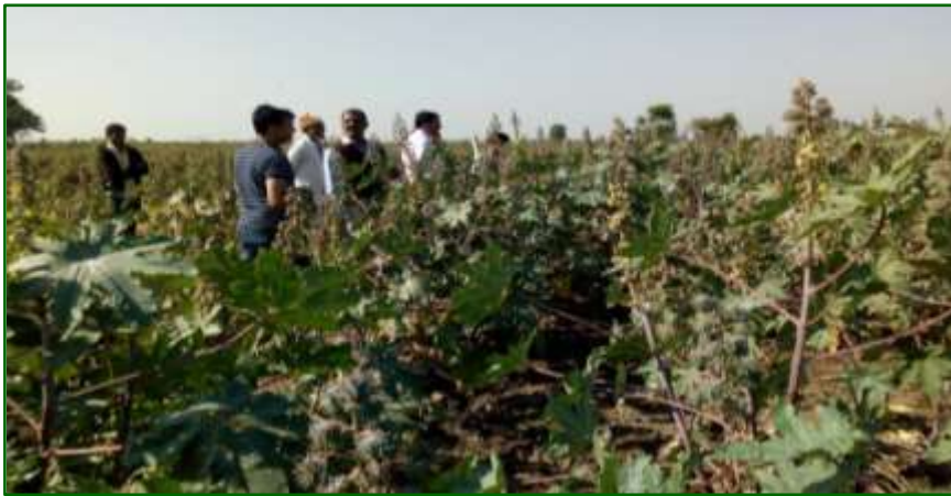
D. A. O. Surendranagar, P. D., ATMA and KVK Senior Scientist diagnosing castor crop of Kharwa village of Wadhwan on 28/12/2017 Cv: GCH-7, Excess Male flowering conversion