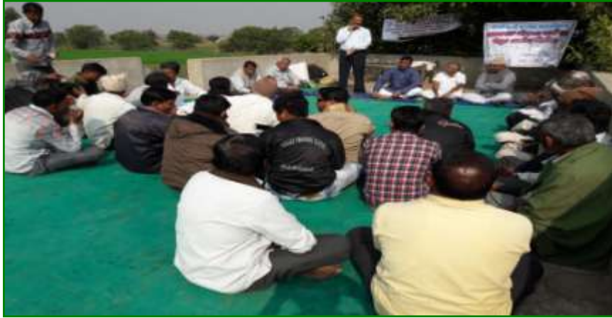
Off Campus Training Programme at Sanosara village of Thangadh Dt.:9 th January, 2018