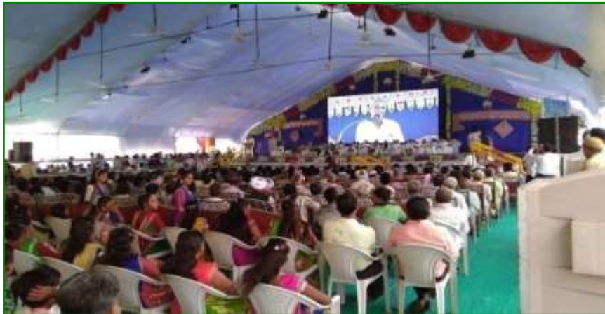
Kharif Krishi Mahotsav-2017 at Wadhwan Dt.: 23 th May, 2017