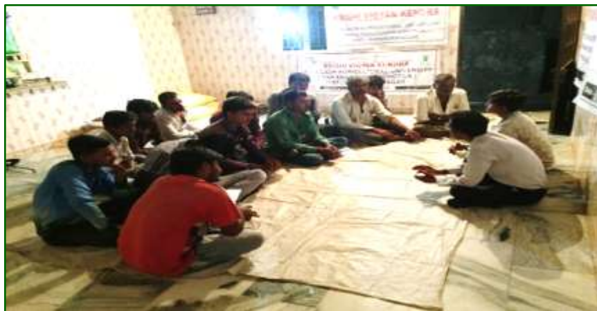
Night Meeting at Sangani village of Chotila taluka Dt.: 31 th May, 2017