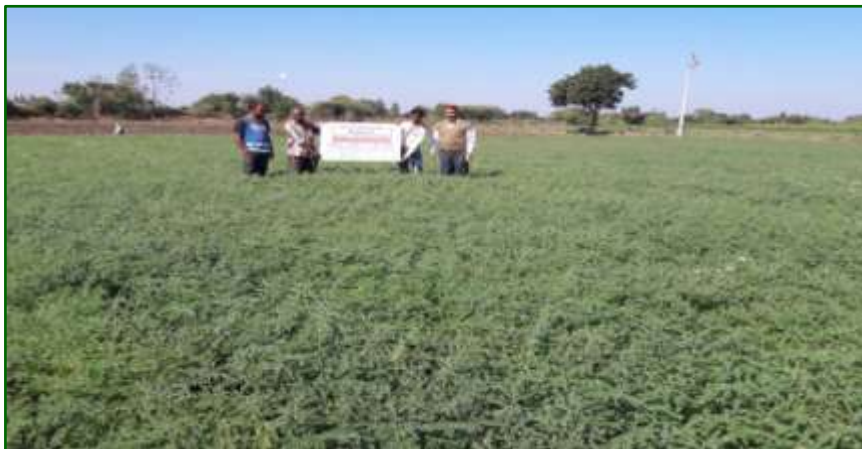
FLDs on chick pea at Ramdevgadhi village of Chuda taluka