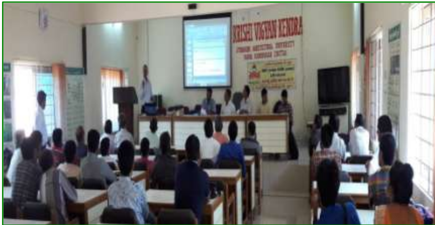
In-service Training Programme at KVK, Nana Kandhasar Dt. 02/01/2018