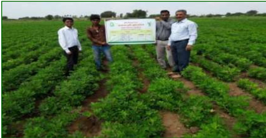
FLDs on groundnut at Dharadungari village of Sayla taluka