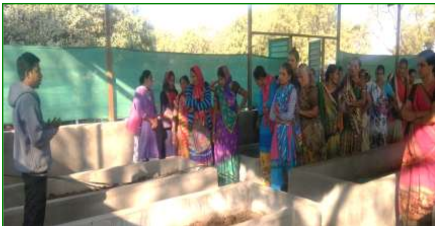
Farm women visited Vermi compost Unit at KVK, Nana Kandhasar on 02/01/2018