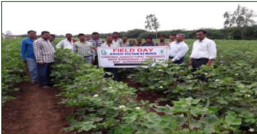
Celebration of field day on cotton at Doliya village of Sayla taluka on 22 th Sept 2017