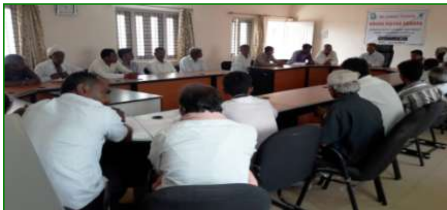
On Campus Training Programme at KVK, Dt.: 6-7 June 2017