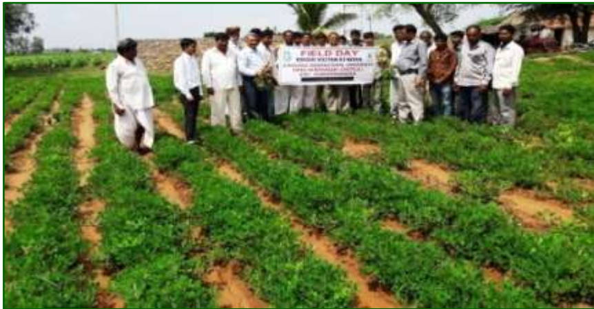
Celebration of field day on Groundnut crop at Dharadungari village of Sayla taluka on 22 th Sept 2017