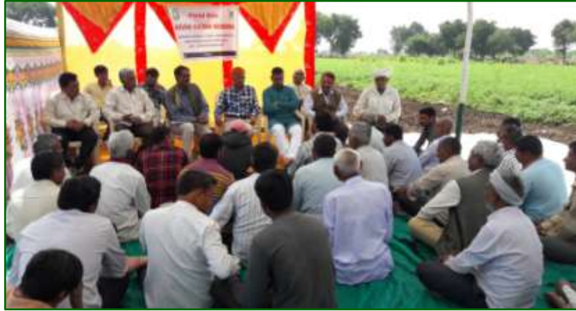
Celebration of field day on Wheat at Karmad village of Chuda taluka on 8 th February 2018