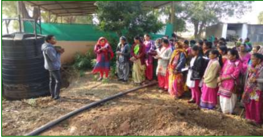
Farm Women visited Bio Gas Demo. Unit of KVK on Dt.: 02/01/2018