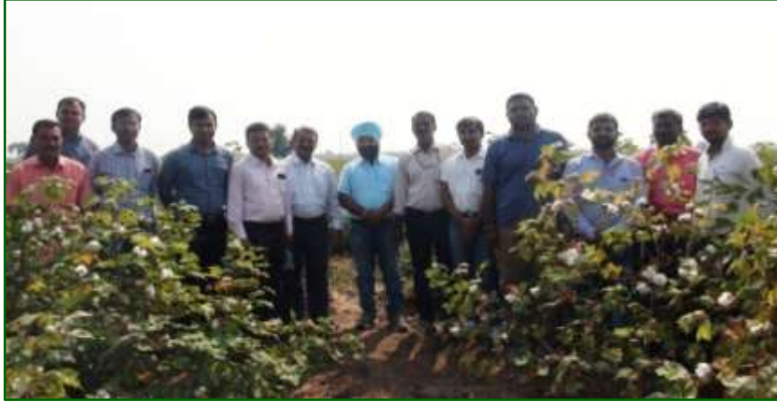
Sr Scientist and Head, KVK with officers of line department visiting cotton crop field at Nana Ankevaliya, Ta.: Lakhtar Date:-10/11/2017