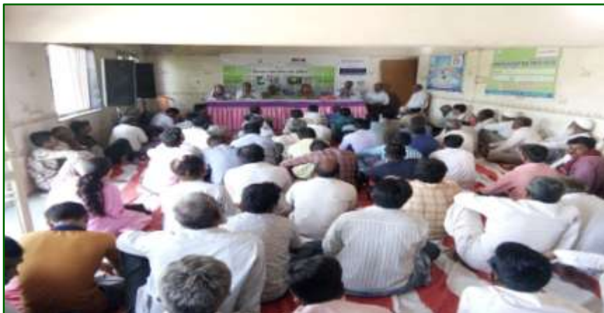
Sponsored training programme in association with AKRSP at Chotila on 4 th October, 2017