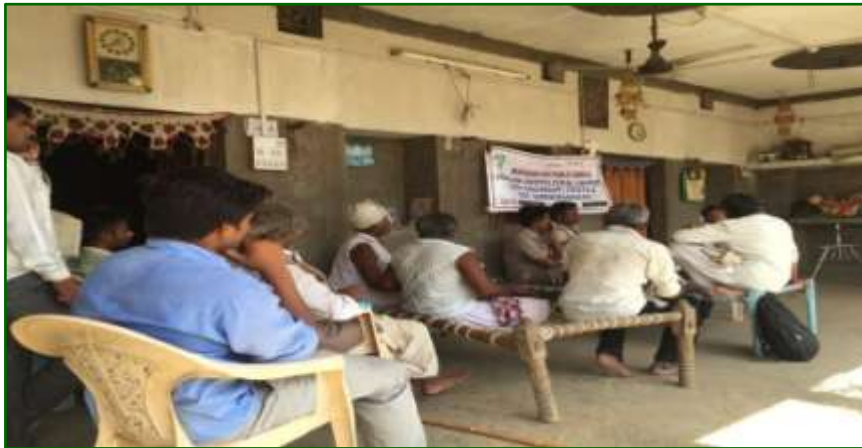
Participating farmers during Swachhhta awareness meeting organized by the KVK at Lakhachokia during Swachhhta Pakhwada Dt.: 31/5/2017