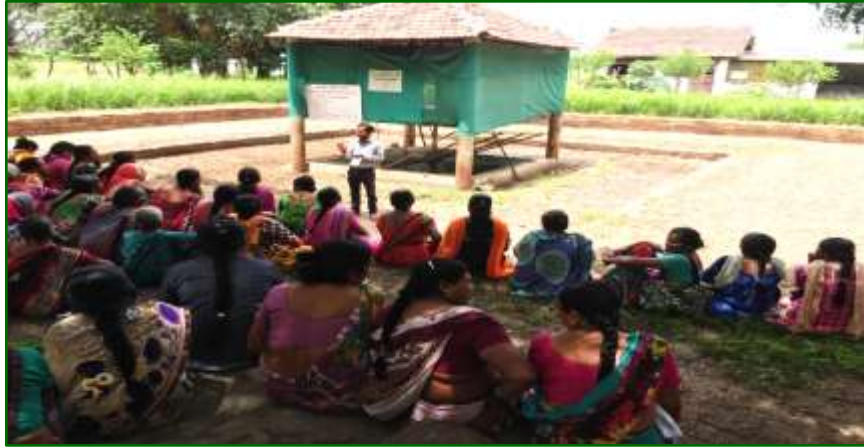
Celebration of Mahila Krushi Divas on 8 th August, 2017